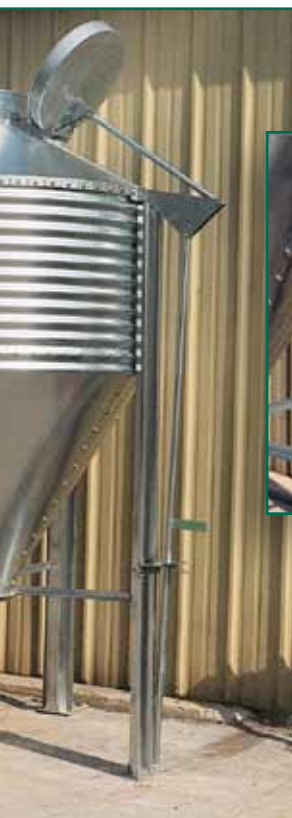
Roof ladder is provided on all VAL-CO bin models. Sidewall ladder and safety cage is available as optional equipment.