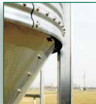
Drip edge directs moisture away from the taper hopper.