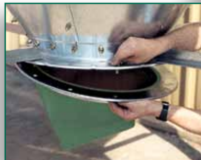
Boot attachment with the VAL-CO split collar allows for fast, easy installation.