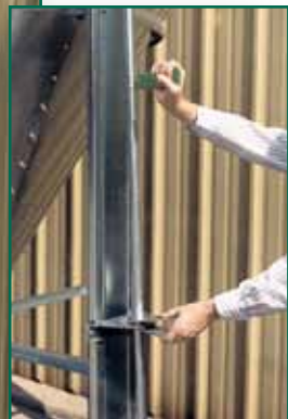
Above, the VAL-CO pinch-lock lid opener is easy to operate.